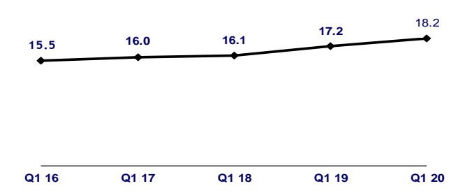
Capital Adequacy Ratio - %